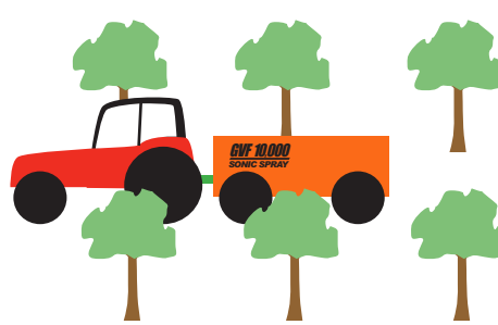
Sonic Spray shuts off when no tree is present in either row.