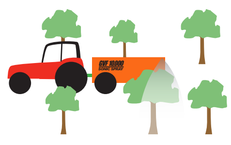
Sonic Spray works in any type of orchard growth whether it is young or mature, and even if the tree spacings are inconsistent.