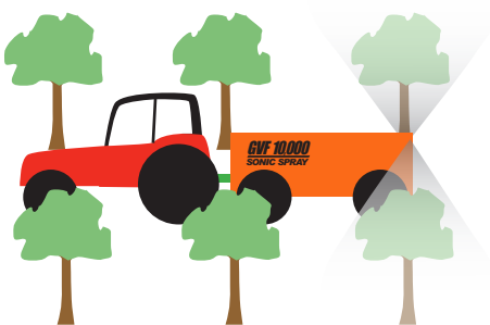
Sonic Spray allows the spray to turn on only when a tree is present.